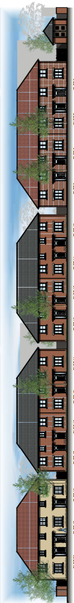
STREET SCENE C-C CORE TRADITIONAL CHARACTER AREA