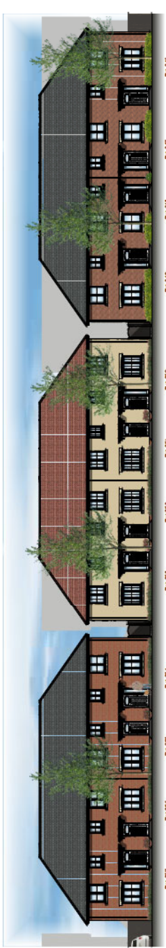
STREET SCENE A-A CORE TRADITIONAL CHARACTER AREA