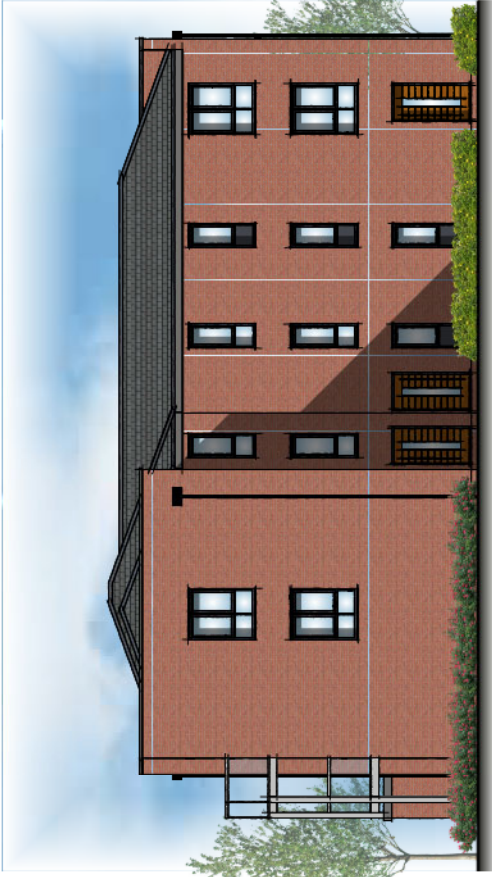
REAR / SIDE ELEVATION