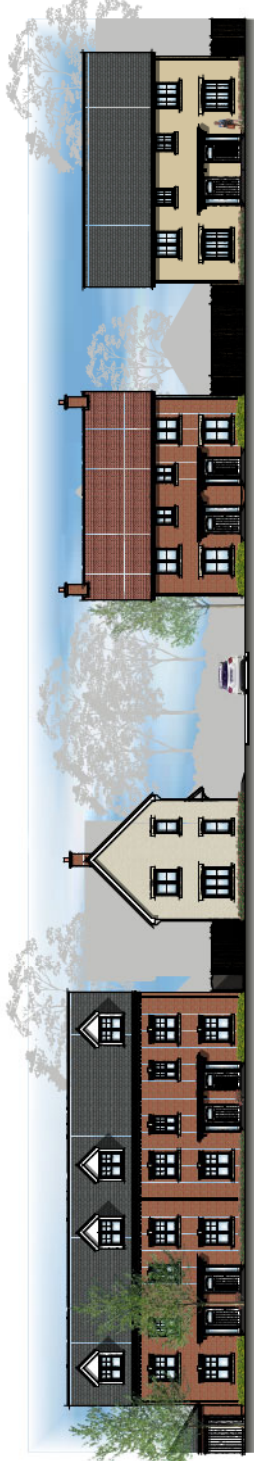
STREET SCENE B-B CORE TRADITIONAL CHARACTER AREA