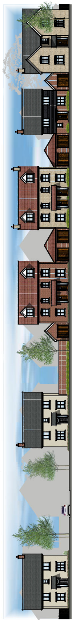
PLOT 48 PLOT 49 PLOT 50 PLOT 51 PLOT 52 PLOT 53 PLOT 54 PLOT 55

STREET SCENE F-F GREEN CORRIDOR CHARACTER AREA