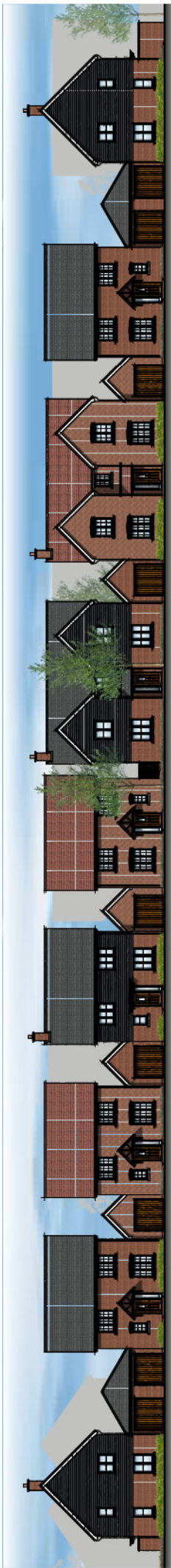
PLOT 198 PLOT 199 PLOT 200 PLOT 201 PLOT 202 PLOT 181 PLOT 182 PLOT 183 PLOT 184

STREET SCENE F-F GREEN CORRIDOR CHARACTER AREA